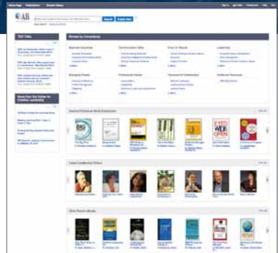
A turnkey learning solution