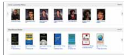
A robust video collection

Browse over 700 videos from leaders such as Marshall Goldsmith ( The Leader of the Future ) and Stephen R. Covey ( The Seven Habits of Highly Effective People ).