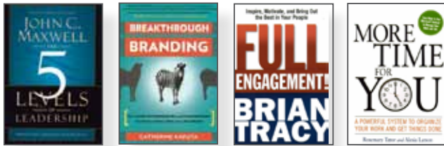
Concise yet comprehensive summaries of the best business books

Give your employees summaries of the top business books, organized by learning category.